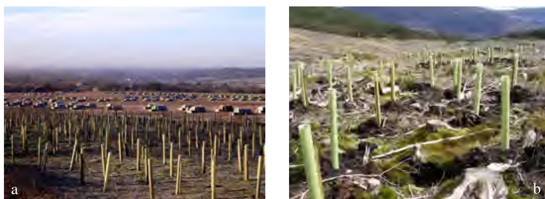
Figure 7. 'New woodland' a) after pigs and b) after forestry.

Because of his obsession with gardening, man considers that, if new woodland is to succeed, its soil should be entirely homogeneous, 'weed'-free, contain as much dung