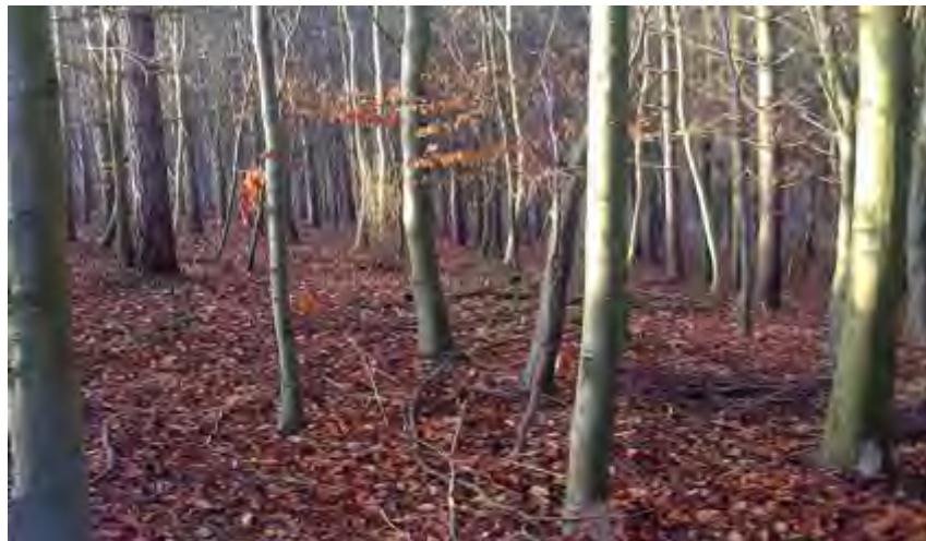
Figure 8. Modern, created ‘woodland’ aged 15-20 years. [Lack of diversity made choosing a photograph easy]