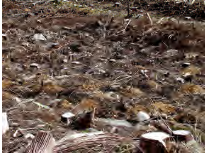
Figure 2. After the Harvester.

The Harvester's huge wheels churn the soil literally everywhere, ripping, inverting and mixing it. Where the Forwarder (collects the trunks) makes its regular journeys it digs compacted ruts up to a metre deep. All understorey plants are exposed, raked up and crushed. Virtually none survive, except perhaps preserved in seed/spore banks. At the same time, microbial communities that have built up over many decades are severely damaged as the soil is