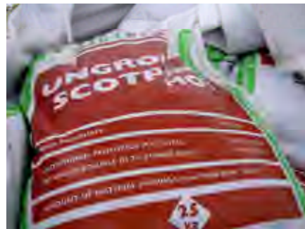
Figure 6. Rock phosphate at the ready.