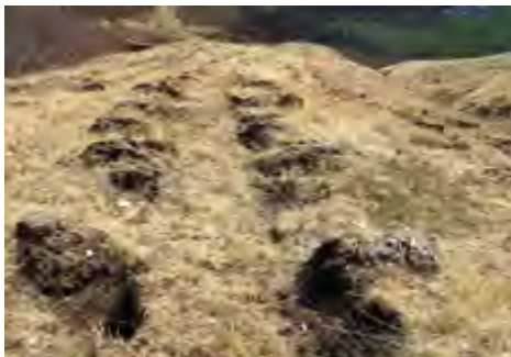
Figure 5. Rows of excavated mounds, each once planted with a sapling.