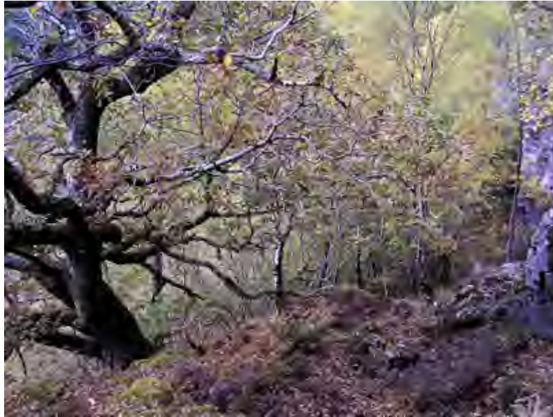
Figure 9. Ancient woodland aged up to 9,000 years. [Choosing a single photograph to represent such a varied subject was very difficult]

Biodiversity, a naturally-occurring seed source, an unpolluted starting soil, several centuries and, if they must interfere, people who understand woodland ecology, are the ingredients of woodland creation, not a patch unwanted land, a plough, a bundle of saplings, a dollop of fertiliser and a load of hogwash.