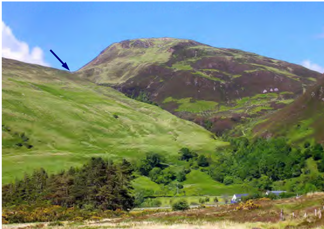
Figure 3. Ancient woodland and natural regeneration (lower right) and new ‘woodland’ (hillside) on either side of the Moine Thrust gully (arrow) at Auchtertyre in the Scottish Highlands.

When the forester has finished with the land where conifers once stood or the farmer needs to take a few acres out of food production or somebody decides woodland would be a good idea, grants are available to assist them to plant trees. Someone steps forward with the promise to create woodland. In my opinion, only Nature (God, if you are a believer) can do that. However, if man must attempt the nigh on impossible, we have the choice of taking an educated approach based on ecology, as has been done in Milton Keynes (Francis et al. , 2001), or we can just plant trees.